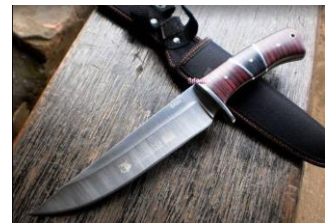
Columbia A02 Knife