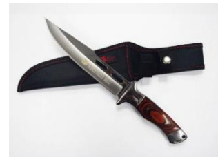
Columbia SA42 Knife